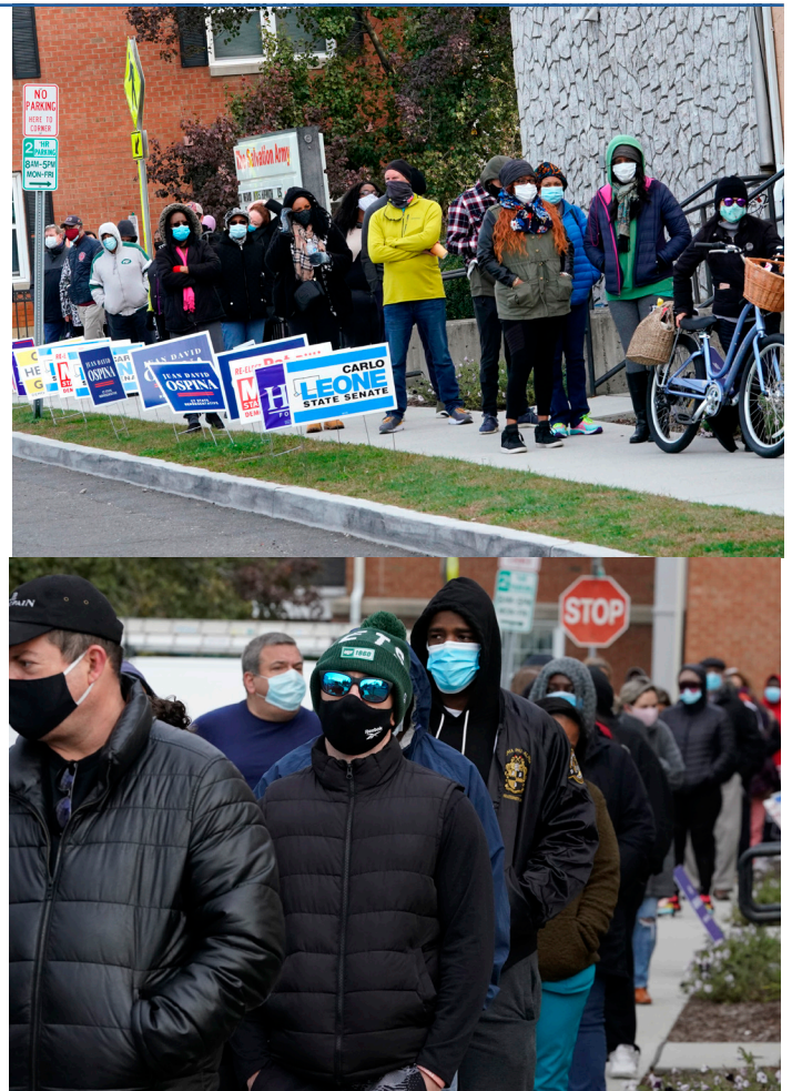
Voters wait to cast their ballots at the Salvation Army of Stamford, Connecticut on November 3, 2020.

With Black and Latino voters facing longer voting lines, no early voting (as of yet), and limited access to absentee voting, Connecticut has some of the most restrictive voting laws in the nation. Conditions that can foster voting discrimination — such as unfair districts or at-large systems that weaken Black and Brown voting power, inaccessible polling locations, insufficient language assistance for voters who don’t speak English, and even outright voter intimidation — endure throughout the Nutmeg State. One reason why is that many voting rights abuses happen at the local level, where the legal tools and resources to investigate and prosecute wrongdoing aren’t available.